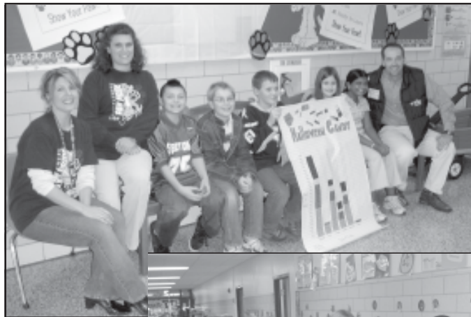
Maplemere's donation to Winning Smiles Dentistry and the 16 Student Council members who helped with the candy drive.