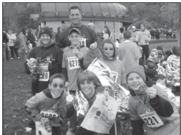
Glendale's School Marathon competitors.