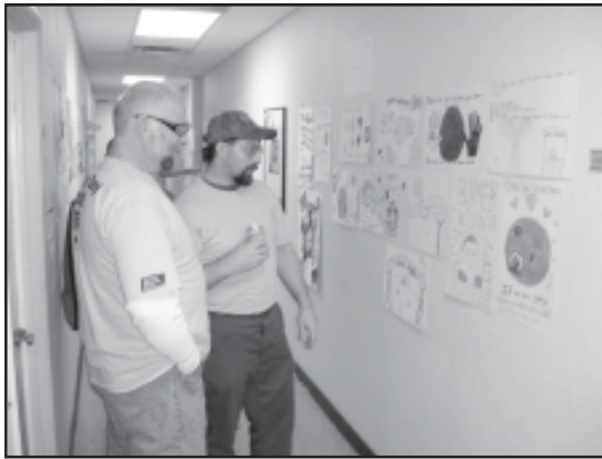
(Below): Watson Bowman Acme employees vote on posters. (Right): 8th grade winners of the poster contest.