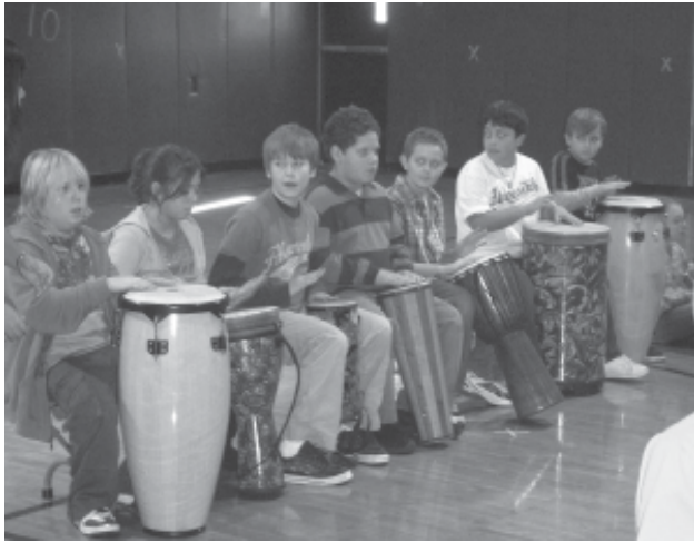
Fifth graders at Glendale perform an authentic African drumming and dance concert on Thursday, October 23 at the school.