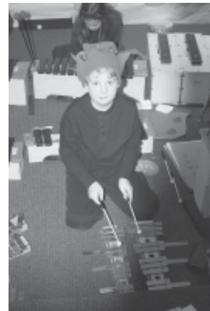
On Wednesday December 17, 2008 a mix of Heritage students performed original songs composed by Heritage students.