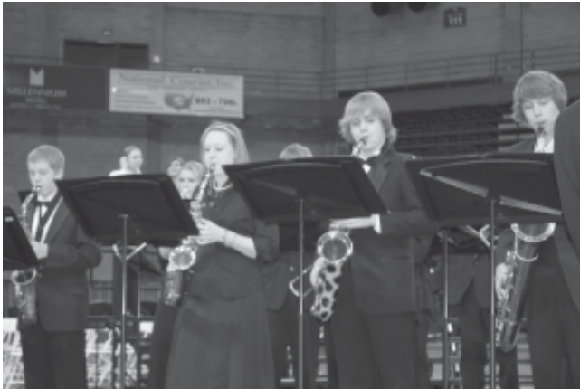
The high school jazz ensemble performs at the District Music Festival on Sunday, January 25. Over 1,500 people attended the event in support of Dollars for Scholars.