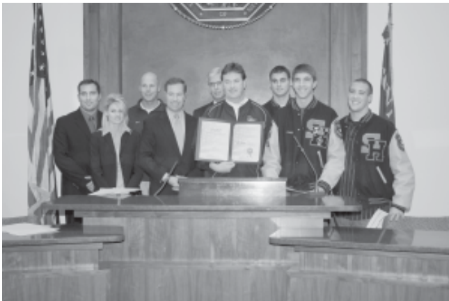
The high school football team recently received an Erie County proclamation for winning the Class A state high school football championship.