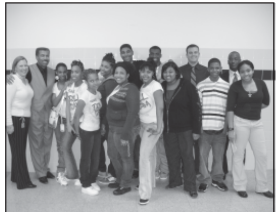
Sweet Home's SOUL Brothers & Sisters Group

The group meets every Tuesday after school.