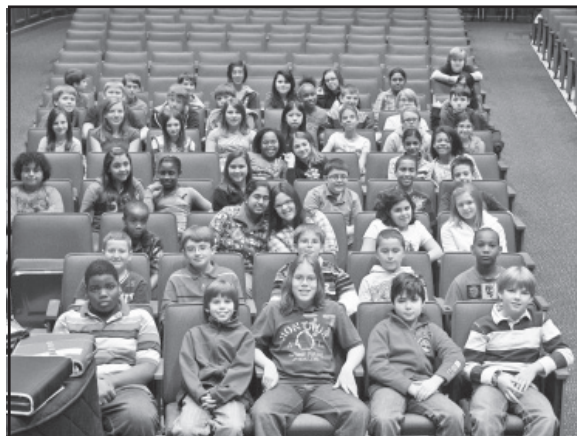
Middle School 2011 Spelling Bee Contestants