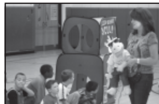
The Yellow Dyno Child Abduction Safety Program visited all four district elementary schools in 2007-08.