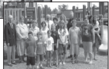
Glendale Elementary Playground Committee with Senator Rath.