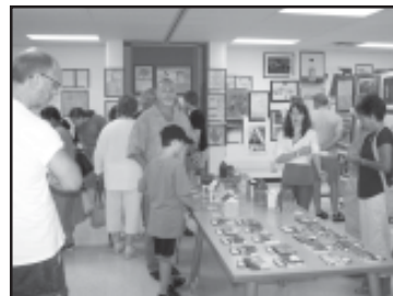
Friends and family enjoy the Middle School Art Show on Friday, June 6.