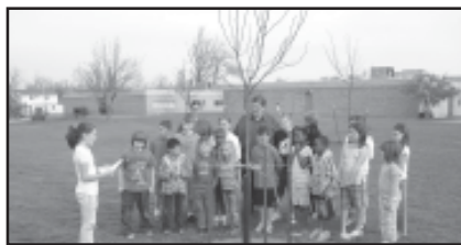
Willow Ridge Arbor Day ceremony

Thanks to a donation from Amherst North Rotary and Schichtel's Nursery, all of the schools in the Sweet Home Central School District were able to celebrate Arbor Day on Friday, April 25. Throughout the day, each of the schools had small ceremonies and assemblies honoring Arbor Day and to plant their tree. This year represents the sixteenth year in a row that Amherst North Rotary has sponsored Arbor Day at Sweet Home.