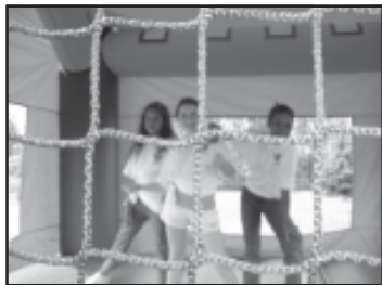
These youngsters enjoy some time in the bounce house at Heritage Heights picnic on June 23.