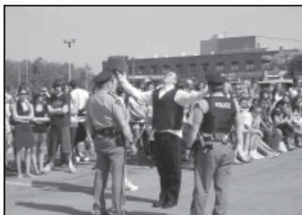
This actor shown is put through a DWI check with an Amherst Police officer.

The assembly program was put together through the collaborative efforts of the high school Parent Teacher Student Association (PTSA), high school Physical Education staff, Youth to Youth Group and the Getzville Fire Department and was designed to help seniors better understand the ramifications of drinking and driving. The events of the program were designed to be as true-to-life as possible as a number of police, fire and ambulance vehicles responded to the accident and students were cut out of the vehicle using the jaws of life.