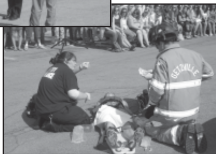
The Getzville Fire Department tend to a student actor at the scene of the staged accident.