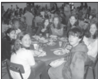
These middle school students are all smiles at the annual Breakfast of Champions on May 30.