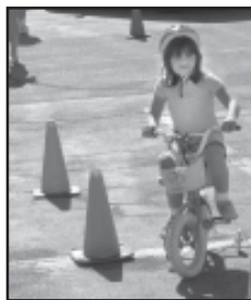
These Willow Ridge kindergartner shows her stuff at the Bike Rodeo on June 11.