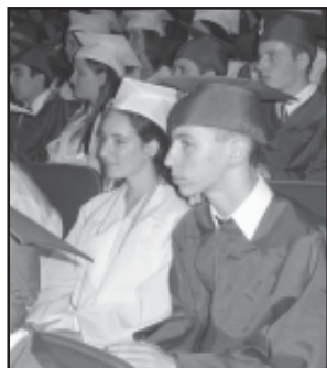
These seniors anxiously await their diplomas.