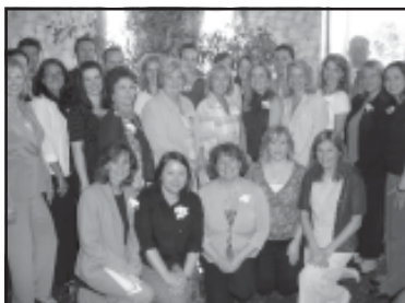
Mentors and new teachers take time out for a group picture at the mentor appreciation in May.