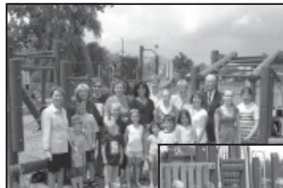
Maplemere Elementary Playground Committee with Senator Rath.

In addition, Glendale received $7,500 from a New York State Assembly Local Initiative through the office of Assemblyman Robin Schimminger. The Glendale Playground Committee is also selling 4" x 8" bricks for $50 as a fundraiser for the school's new playground. The bricks will be part of the new playground's construction. Order forms are available in the school's main office. Questions can be directed to Tammy Sempert at 694-3062.