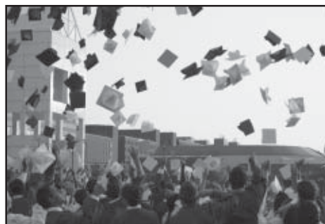
The traditional tossing of the caps following the Commencement Ceremonies.