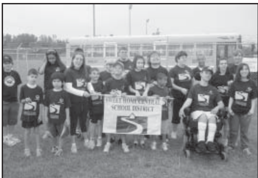
The 2010 Sweet Home Special Olympic Team