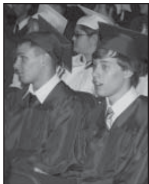
These seniors anxiously await their diplomas.