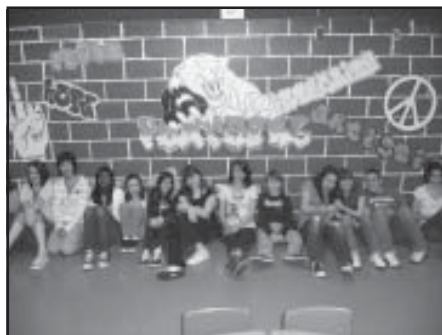
The middle school Art Club recently painted two murals in the cafeteria for the entire school to enjoy.