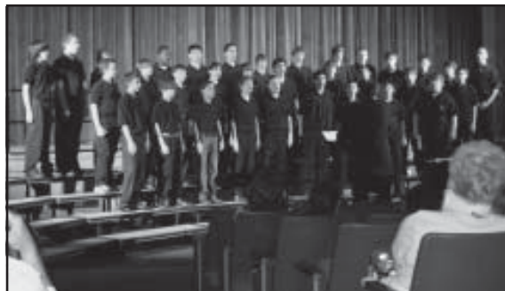
The Gold with Distinction Award Winning Middle School Boys 7-8 Chorus

The months of May and June are competition time for the many musical groups in the Sweet Home Central School District. True to form, the groups did not disappoint with several groups taking top honors at their respective competitions. The award winning groups are outlined below. Congratulations to all on a job well done.