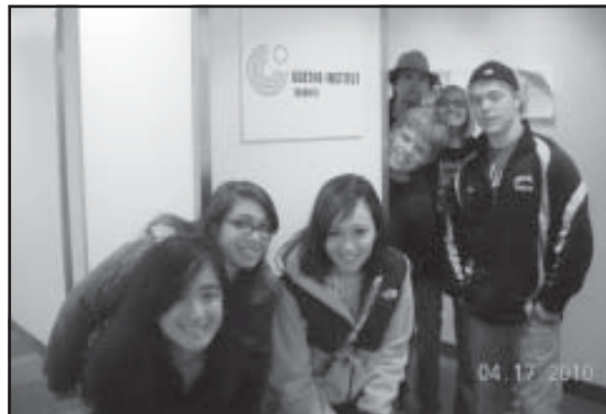
The high school German Club during their visit to Toronto.

The high school German Club went on its annual trip to the Goethe Institute in Toronto on April 17. The Goethe Institute is world-wide and has been set up by the German government for the promotion of the German language and culture. The Institute offers courses in German as well as resources for schools. The students were shown the various facilities like the library, where they can sign out current music CDs as well as German DVDs. After Toronto, the German students went to Hamilton, Ontario to shop at the German-style Denninger's Market. The trip concluded with dinner at the Schwarzwaldhaus Restaurant.