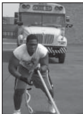
The annual Sweet Home Strongman Competition took place June 11. The events included a school bus pull pictured here.