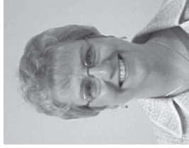
Maplemere Elementary Ann E. Laudisio 250-1550