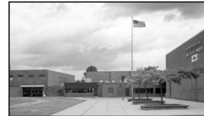
Heritage Heights Elementary